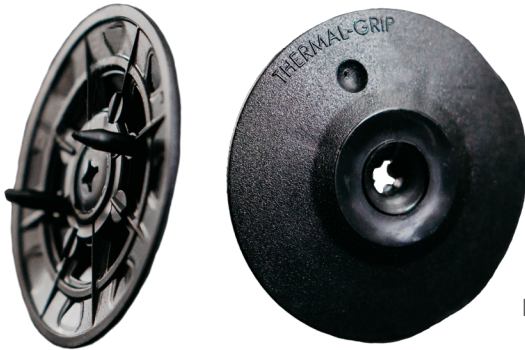
Not to scale.