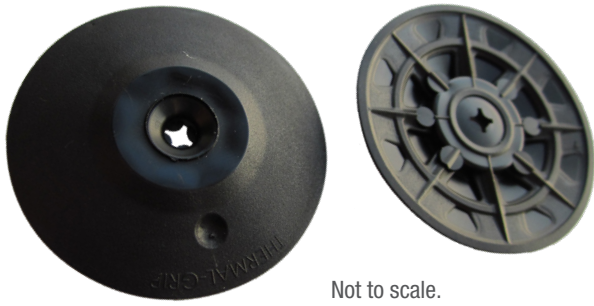
Not to scale.