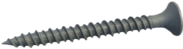
Not to scale.