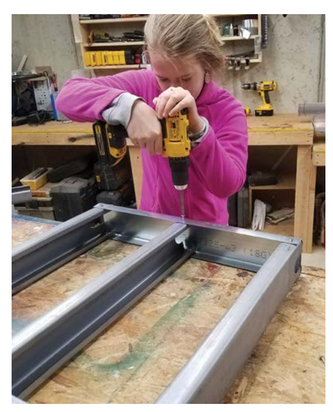
Steel stud construction for the mini "hot box"

My career involves the development and marketing of fasteners for the exterior building envelope, specifically to attach continuous insulation, lath for stucco, building wrap attachment, etc. I am privileged to attend and exhibit at several industry trade shows each year, and I am always on the hunt to nab a souvenir trinket for my children from the many trade show booths. After returning from a tradeshow in early 2017 my 9-year-old son said, "Dad, I know what you need to hand out in your booth. You know the little black washers you sell for attaching rigid insulation? They look like Frisbees. You should order some black Frisbees that have your company logo and hand them out to customers." Brilliant idea.