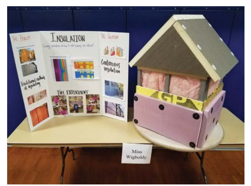
Getting children interested in the construction industry through 6th Grade Science