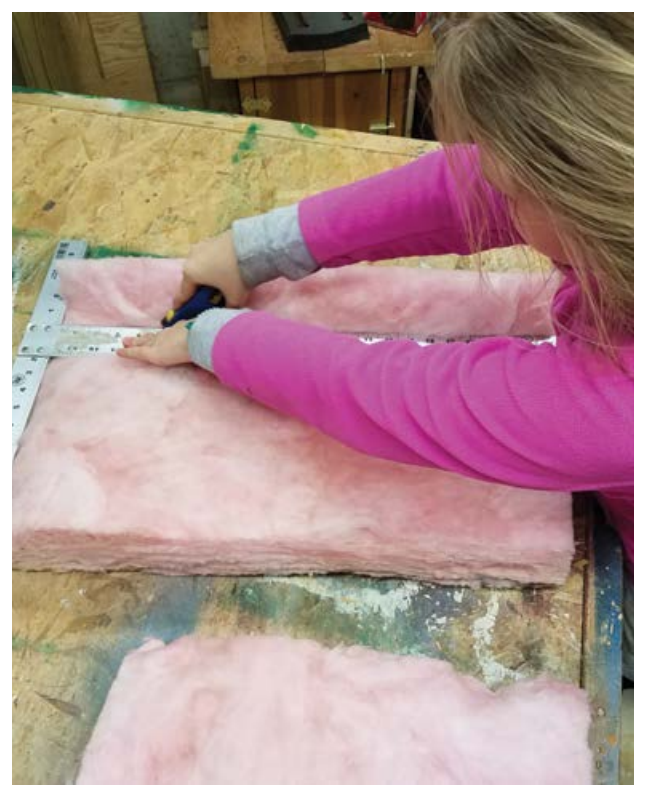
Cutting fiberglass insulation to fit between the wood and steel studs of the mini "hot box".