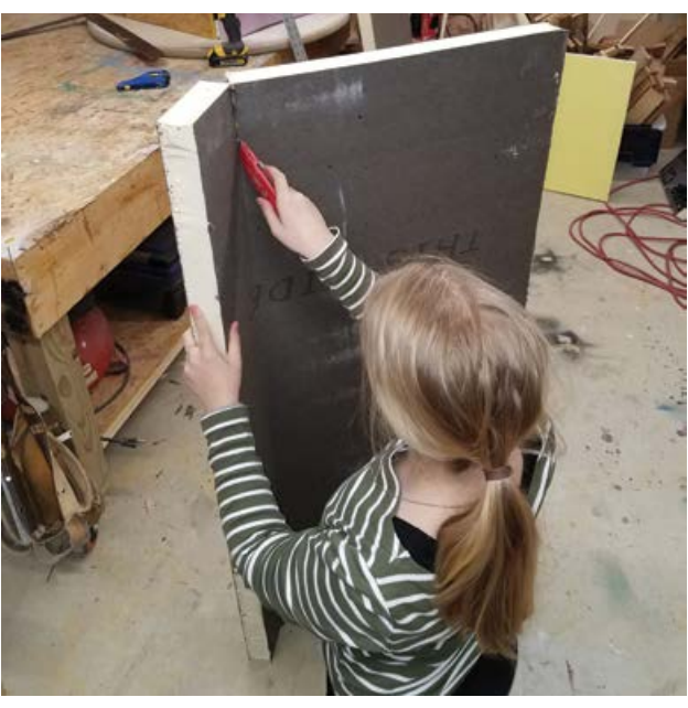
Cutting the roof panels to cap the mini "hot box". Almost ready for testing.

We designed and ordered a few hundred Frisbees, and luckily the INTEX Expo convention was right around the corner and happened to coincide with my children's spring break. My son jumped at the opportunity to join me in the booth to hand out his Frisbees. I was so proud of our newest Junior Marketing Intern and he has been interested in fasteners and our construction industry ever since that trade show.