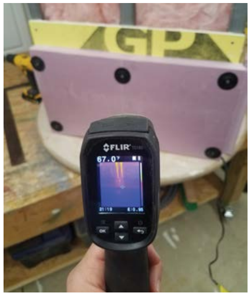
A small heater is placed inside the mini "hot box" structure. FLIR infrared thermal-imaging camera clearly shows the temperature gradient and thermal-bridging of the steel studs, compared to the lower section of the wall covered with continuous insulation.

a significant amount of energy in the country is consumed by heating and cooling our homes and buildings. In fact, around 40 percent of the country's total energy was consumed on heating and cooling residential and commercial buildings in 2016. That is lot of energy just to keep us feeling comfortable. We can reduce this energy consumption and waste by using higher R-value rated insulation materials as well as better insulating techniques. R-value is a measure of resistance to heat flow through a given thickness of material. The higher the R-value the greater the resistance against heat transfer.